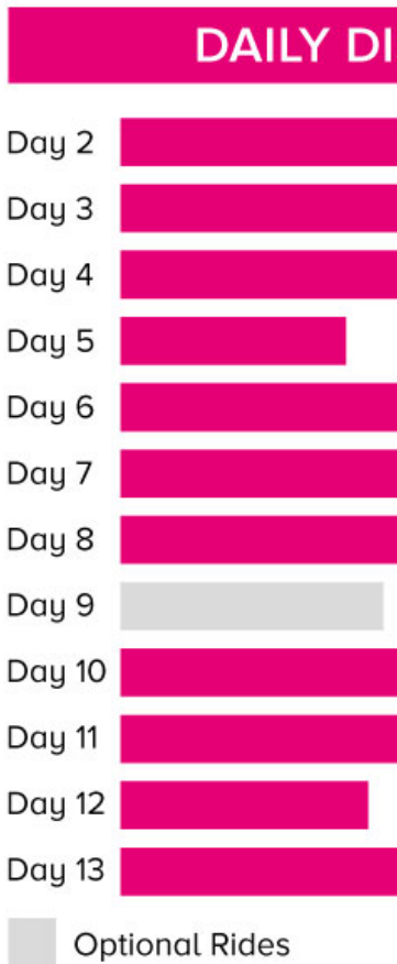
CTB Distance Chart