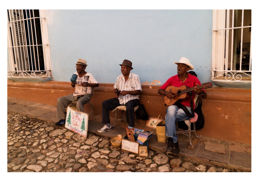
Extend your trip with 7 nights in Cuba