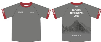
Trek Nepal top

For more information and images see https://keranddowneynepal.com/lodges .