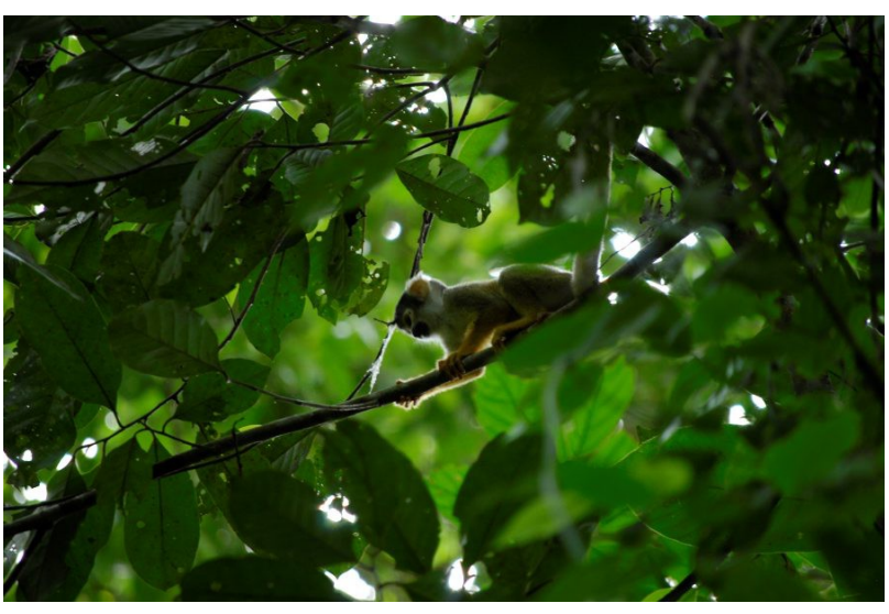
Extend your trip with 3 nights in the Amazon