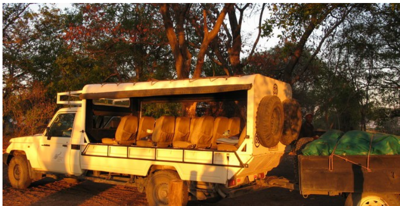
Typical safari vehicle used in Botswana

On this tour we have opted for simple, basic and clean accommodation that provides value for money and a warm welcome. We have selected an interesting variety of accommodation options including a mixture of lodges, wilderness safari camp and a houseboat that allows us to focus on the abundant wildlife within the spectacular inland delta of the Okavango, Chobe National Park and Moremi Wildlife Reserves on the eastern edge of the Delta.