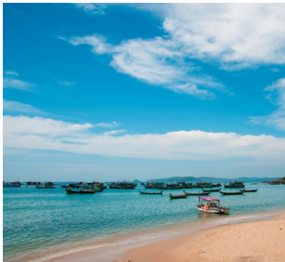
Optional beach extension in Phu Quoc