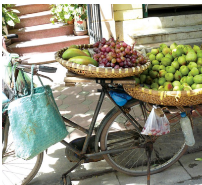
Local trader, Hoi An

Extend your stay on the beach: Why not extend your trip to Vietnam with three nights on the tropical white sand beaches of Phu Quoc Island from £260 per person? Nestled in the warm waters of the Gulf of Thailand this Vietnamese island is 90% national park, a thick-rainforest interior framed by idyllic white sand beaches. Easily accessible by a short flight from Hanoi, Siem Reap or Ho Chi Minh City, this is a great way to unwind after an action-packed trip in Indochina. Click here for more details