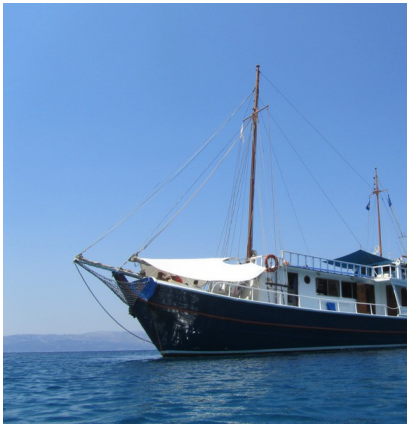
Our traditional Greek sailing boat

Greek sailing holiday: Whether you are new to sailing or an old hand who knows the ropes, an Explore family sailing holiday is ideal for all abilities, no previous sailing experience is necessary. Our Greek skipper Thanos and his crew will be happy to show you the ropes and there is ample opportunity to pick up some sailing skills along the way, alternatively kick back on deck with a book and let the world float by. Wake up to a new view every morning in the Aegean Sea, swim to your hearts content during the day and head ashore to traditional seaside tavernas every night to enjoy hearty Mediterranean cuisine.