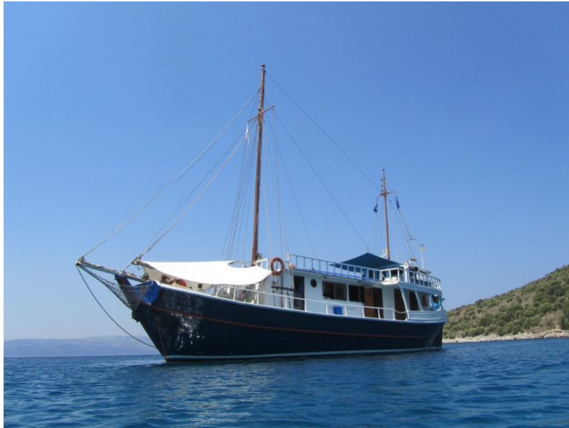
Our traditional Greek sailing boat

Greek sailing holiday: Whether you are new to sailing or an old hand who knows the ropes, an Explore family sailing holiday is ideal for all abilities, no previous sailing experience is necessary. Our Greek skipper Thanos and his crew will be happy to show you the ropes and there is ample opportunity to pick up some sailing skills along the way, alternatively kick back on deck with a book and let the world float by. Wake up to a new view every morning in the Aegean Sea, swim to your hearts content during the day and head ashore to traditional seaside tavernas every night to enjoy hearty Mediterranean cuisine.