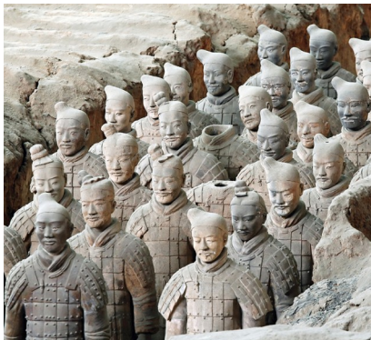
Terracotta Warriors, Xian

Triple rooms: This trip allows the option for triple rooms to be included within the booking on a selected number of night stops within the holiday. If you would like this option, a discount may be applicable on the cost of the trip - please ask our Sales team for further information.