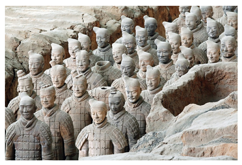
Terracotta Warriors, Xian