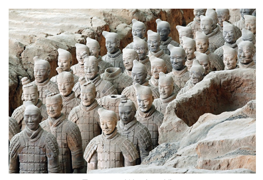
Terracotta Warriors, Xian