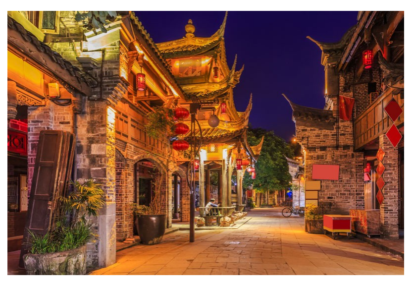
Chengdu historic centre

Triple rooms: This trip allows the option for triple rooms to be included within the booking on all night stops within the holiday, except for the overnight train journeys. If you would like this option, a discount may be applicable on the cost of the trip - please ask our Sales team for further information.