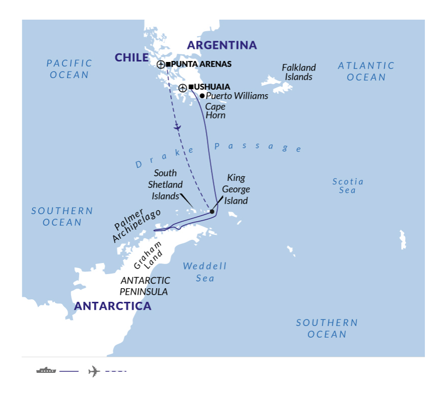
GMAX 2020 Reverse