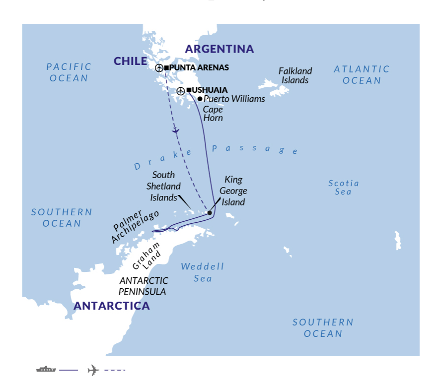
PPAP_2019 Fly Reverse