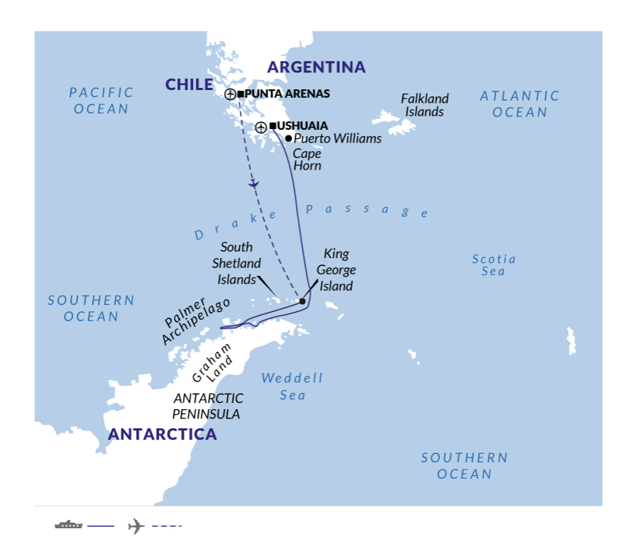
PPAP_2019 Fly Reverse