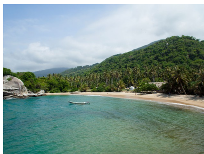
Extend your trip in Tayrona National Park