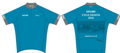
Cycle Croatia Jersey

Cycle Croatia Jersey - Click here to order