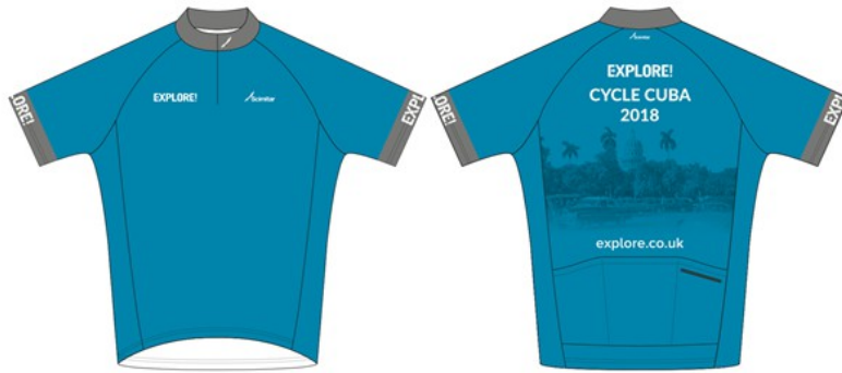
Cycle Cuba Jersey