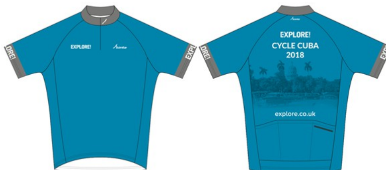
Cycle Cuba Jersey