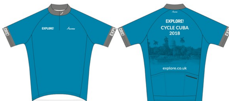
Cycle Cuba Jersey