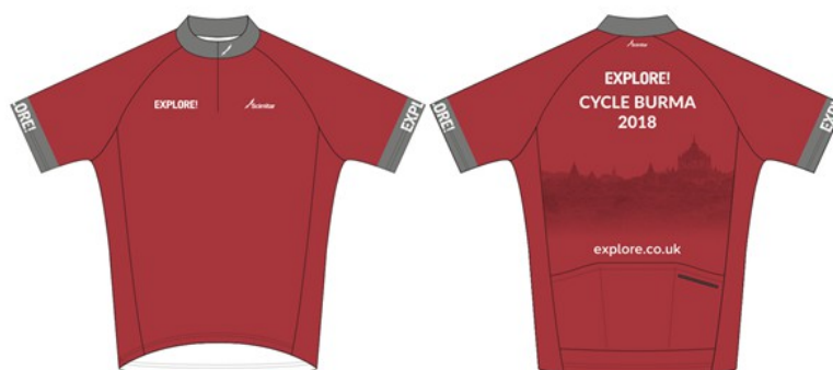
Cycle Burma Jersey