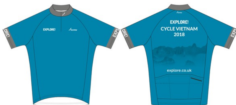
Cycle Vietnam Jersey