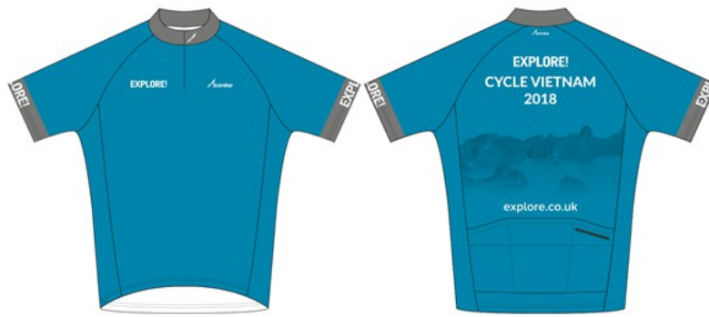
Cycle Vietnam Jersey