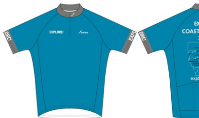
Cycle Coast to Coast Jersey