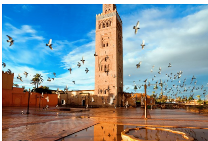
Free Night in Marrakech

Book by 18th January 2018 to get your free hotel night in Marrakech. Quote " Free Pre-trip Hotel " at the checkout or on the phone to receive your free night. Find out more here