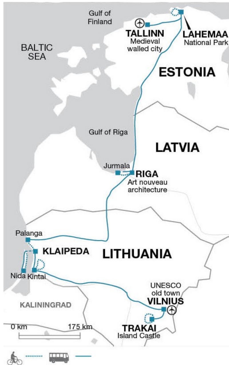
Map (click to enlarge)