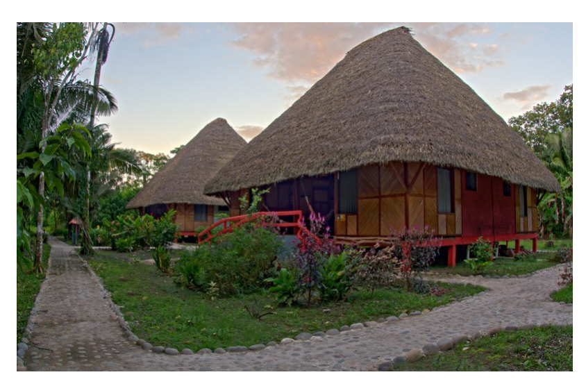
Napo Cultural Centre