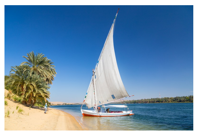
Felucca on the banks of the River Nile