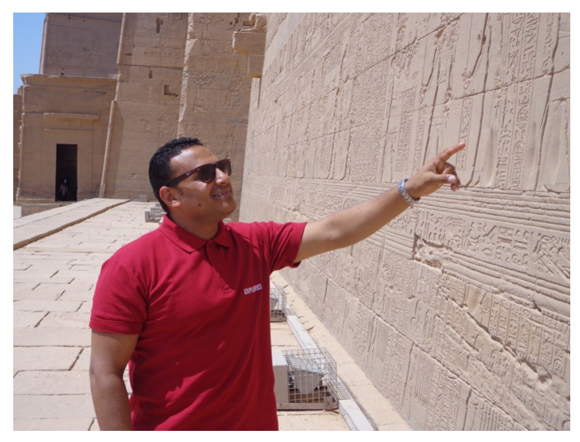
Our Explore Leader, Philae temple