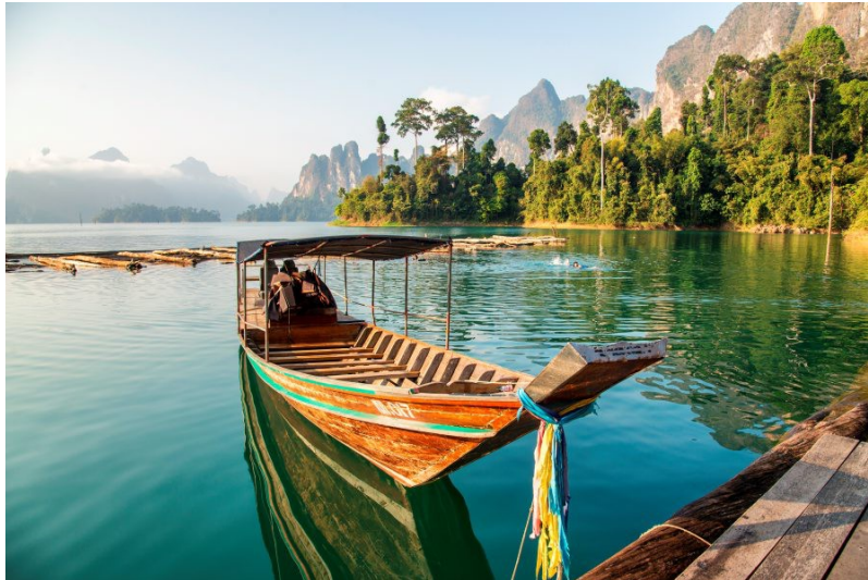
Khao Sok National Park

Triple Rooms: This trip allows the option for triple rooms to be included within the booking on all nights of this trip with the exception of the overnight trains. If you would like this option, please ask our Sales team for further information.