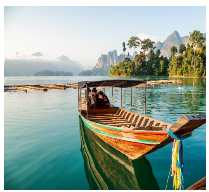
Khao Sok National Park

Triple Rooms: This trip allows the option for triple rooms to be included within the booking on all nights of this trip with the exception of the overnight trains. If you would like this option, please ask our Sales team for further information.