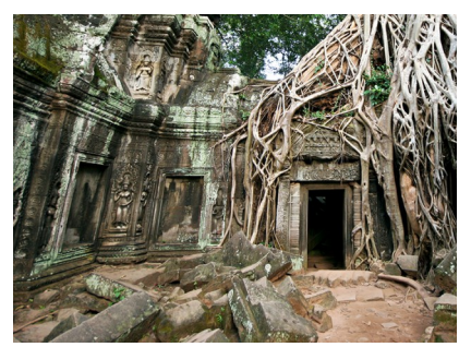
Ta Phrom Temple, Angkor Wat