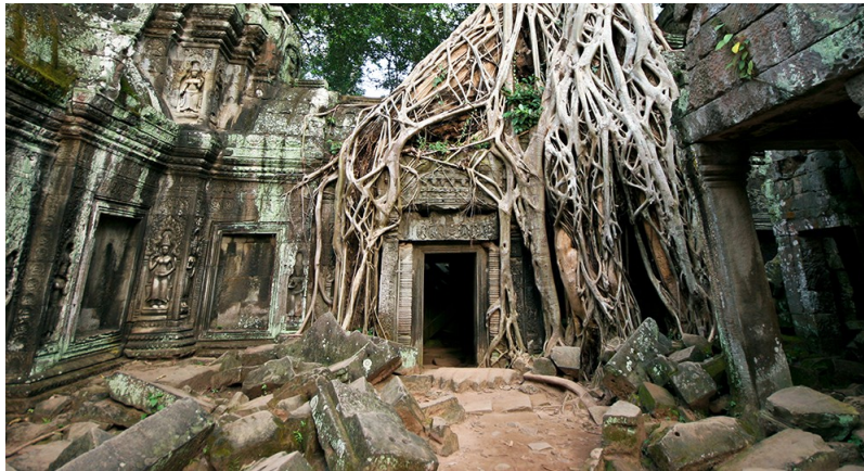
Ta Phrom Temple, Angkor Wat

Triple Rooms: This trip allows the option for triple rooms to be included within the booking on all nights of this trip. If you would like this option, please ask our Sales team for further information.