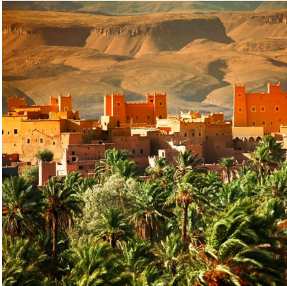
Desert oasis, Southern Morocco

High peaks, vast deserts, captivating Marrakesh: Morocco is an easy going country to travel to with children of all ages and with a direct flying time between London and Marrakesh of just 3 hours 20 minutes, travel comes without the trials of a long haul flight.