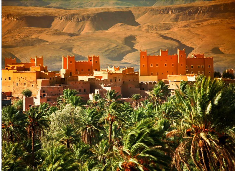
Desert oasis, Southern Morocco

High peaks, vast deserts, captivating Marrakesh: Morocco is an easy going country to travel to with children of all ages and with a direct flying time between London and Marrakesh of just 3 hours 20 minutes, travel comes without the trials of a long haul flight.