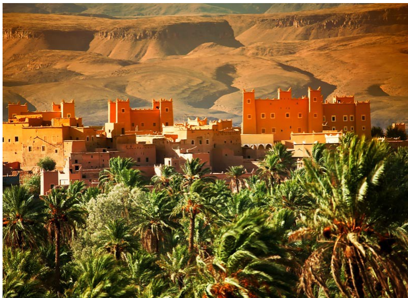
Desert oasis, Southern Morocco

High peaks, vast deserts, captivating Marrakesh: Morocco is an easy going country to travel to with children of all ages and with a direct flying time between London and Marrakesh of just 3 hours 20 minutes, travel comes without the trials of a long haul flight.