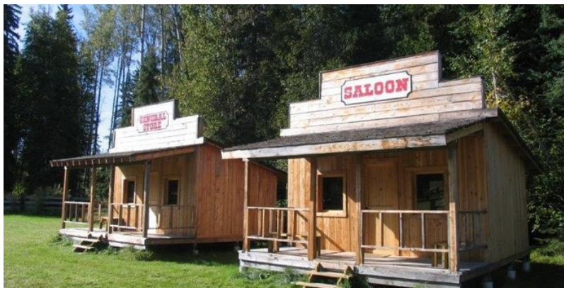
Wells gray cabins

Vehicle information: The vehicles that we use on our Canadian trips are either low-roof or high-roof transit vans. Where possible, we aim to get the high-roof ones, allowing that little bit of extra comfort. Although not flashy, these small-group vehicles are perfect for