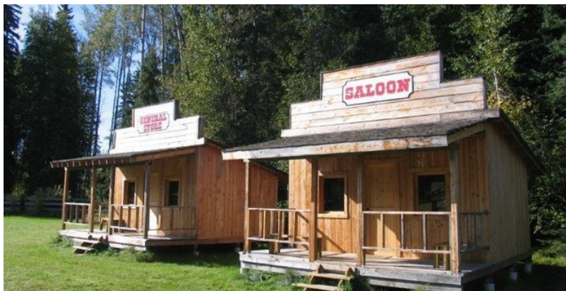
Wells gray cabins

Vehicle information: The vehicles that we use on our Canadian trips are either low-roof or high-roof transit vans. Where possible, we aim to get the high-roof ones, allowing that little bit of extra comfort. Although not flashy, these small-group vehicles are perfect for exploring western Canada as they allow greater flexibility to get to those more off the beaten track places. Your Explore Leader will rotate seating positions regularly within the van. Please see the image gallery for further details.