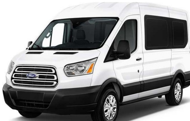
Typical vehicle used in Canada