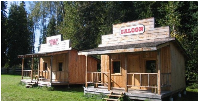
Wells Gray cabins

Vehicle information: The vehicles that we use on our Canadian trips are either low-roof or high-roof transit vans. Where possible, we aim to get the high-roof ones, allowing that little bit of extra comfort. Although not flashy, these small-group vehicles are perfect for exploring western Canada as they allow greater flexibility to get to those more off the beaten track places. Your Explore Leader will rotate seating positions regularly within the van. Please see the image gallery for further details.