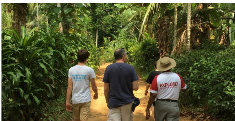
Jungle walks in Kitulgala

Fitting into just one week, this trip is ideal for either October or February half term, escaping the long winter nights or over one of the school holidays. We offer an east and west coast version of this family holiday to benefit from the best weather conditions on each coast, staying on the east coast over the summer holidays and October half term and switching to the south west coast over Christmas, February and Easter.