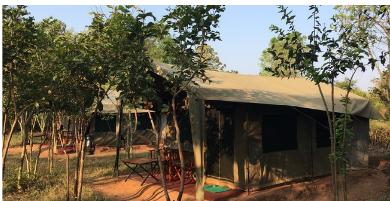
Tented camp at Wilpattu National Park