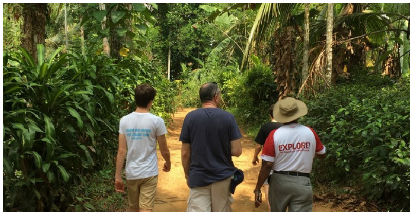
Jungle walks in Kitulgala

Fitting into just one week, this trip is ideal for either October or February half term, escaping the long winter nights or over one of the school holidays. We offer an east and west coast version of this family holiday to benefit from the best weather conditions on each coast, staying on the east coast over the summer holidays and October half term and switching to the south west coast over Christmas, February and Easter.