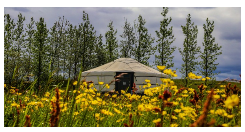
Explore Yurt camp in the summer

Triple Rooms: This trip allows the option for a limited number of triple rooms to be included for the whole trip. Three yurts have a sofa bed that can be used as an extra bed. If you would like this option, please ask our Sales team for further information.