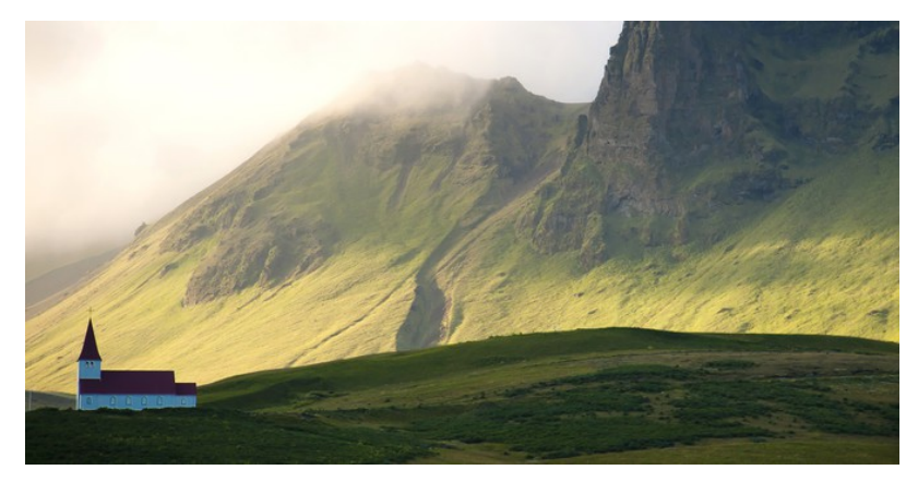
Wild landscapes around Vik