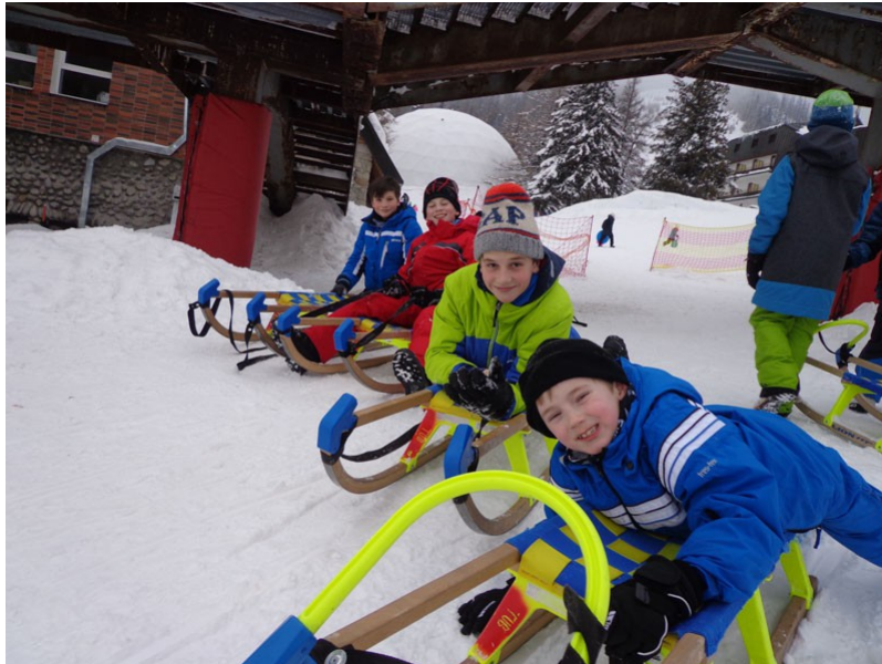
Snow fun! Tobogganing in Velka Studena, Slovakia

Family winter adventure holiday: For the majority of families, if you mention a winter snow holiday you think of finely groomed piste in a ski resort. For those families new to skiing or those looking for a taster of skiing with plenty of other activities to keep the family entertained, our winter family holiday in Slovakia is ideal.