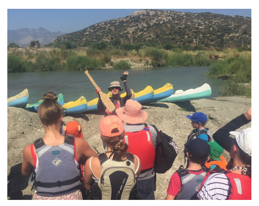
Preparing to river canoe

Turkey family holiday: Combining a week sailing in the warm waters of the Mediterranean with an active, fun week based in seaside town of Kas this two week family holiday to Turkey is an ideal combination of relaxation, lots of swimming opportunities and varied activities to keep the whole family entertained.