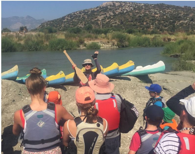
Preparing to river canoe

Turkey family holiday: Combining a week sailing in the warm waters of the Mediterranean with an active, fun week based in seaside town of Kas this two week family holiday to Turkey is an ideal combination of relaxation, lots of swimming opportunities and varied activities to keep the whole family entertained.