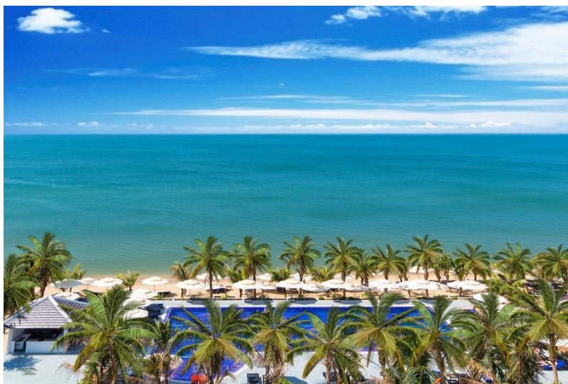
Beach and Hotel Pool on Phu Quoc

Extend your stay on the beach: Why not extend your trip to Vietnam with three nights on the tropical white sand beaches of Phu Quoc Island? Nestled in the warm waters of the Gulf of Thailand this Vietnamese island is 90% national park, a thick-rainforest