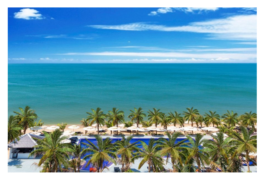
Beach and Hotel Pool on Phu Quoc

Extend your stay on the beach: Why not extend your trip to Vietnam with three nights on the tropical white sand beaches of Phu Quoc Island? Nestled in the warm waters of the Gulf of Thailand this Vietnamese island is 90% national park, a thick-rainforest interior framed by idyllic white sand beaches. Easily accessible by a short flight from Hanoi, Siem Reap or Ho Chi Minh City, this is a great way to unwind after an action-packed trip in Indochina. Click here for more details.