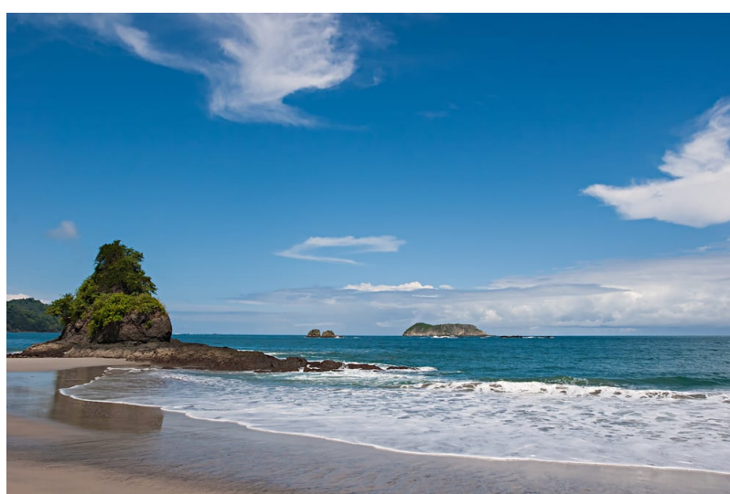
The beach at Manuel Antonio National Park