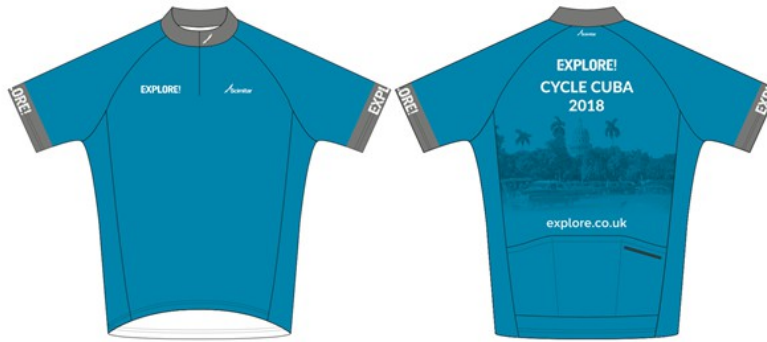
Cycle Cuba Jersey