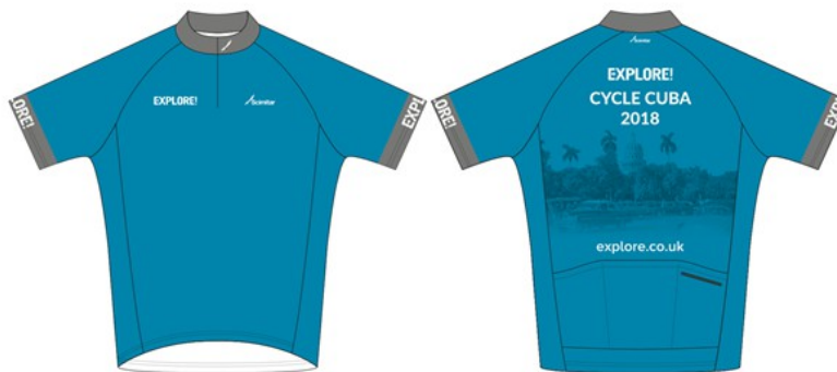
Cycle Cuba Jersey