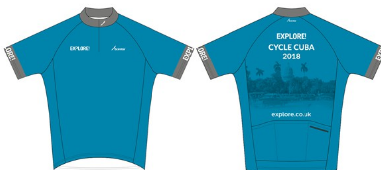
Cycle Cuba Jersey