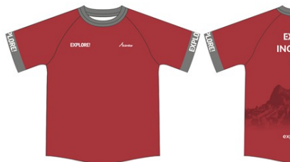
Inca Trail top