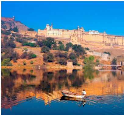
Amber Fort, Jaipur

Indian Odyssey: Arriving in India, whether for the first or tenth time, is a real adventure. Tuk tuks, taxis and rickshaws jumble for space on the roads in what, at first, appears chaotic but on closer inspection works like a carefully choreographed dance. You'll never forget the look on your children's faces, eyes out on stalks at the sights, sounds and smells and sheer awe of this truly beautiful country. Discover the desert landscapes of Rajasthan and the trio of cities that make up The Golden Triangle. India is a country your children will remember forever.